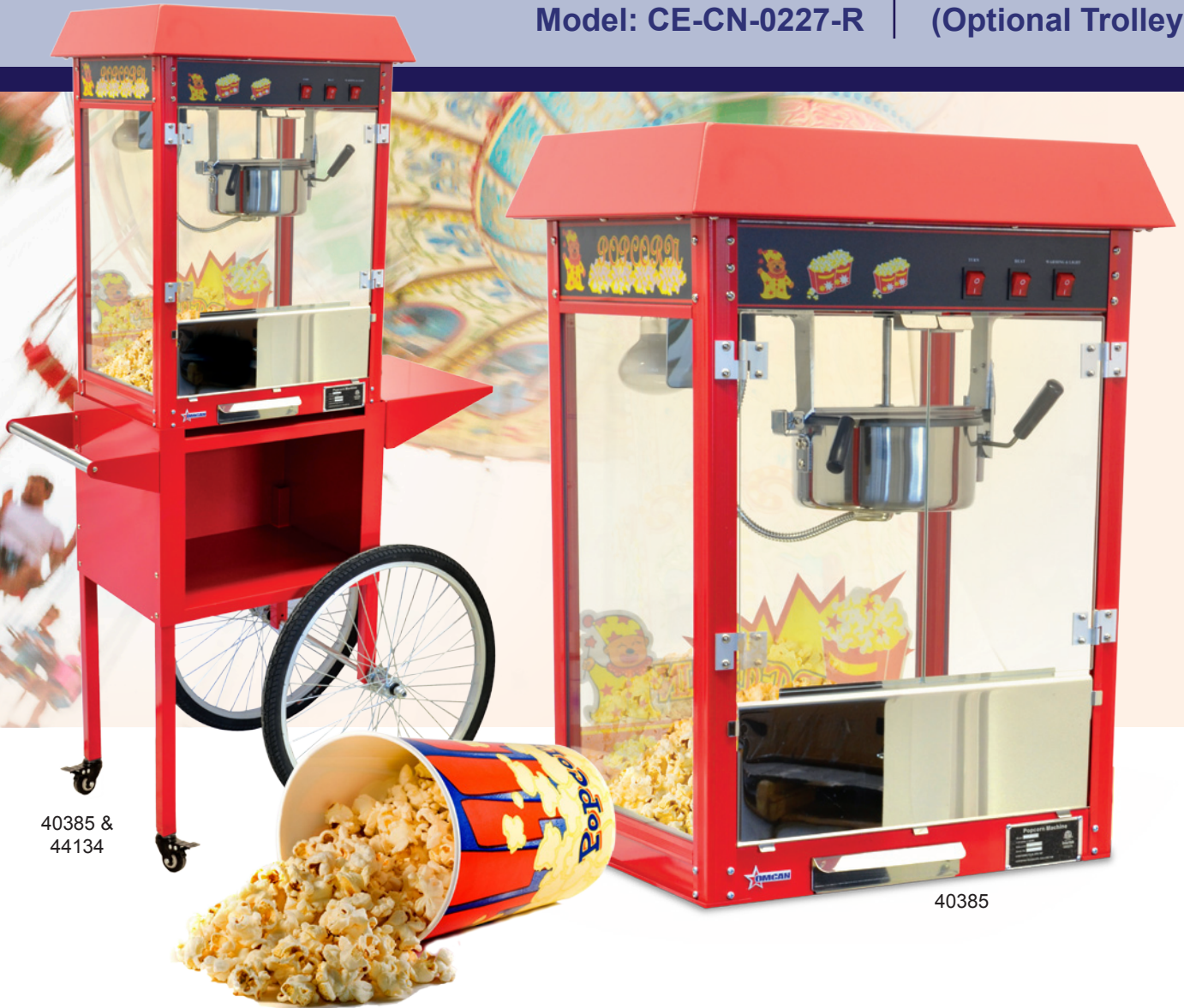
40385 & 44134