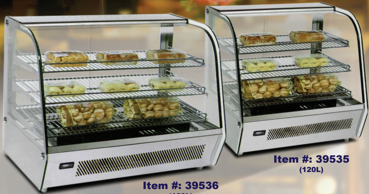
Item #: 39536 (160L)