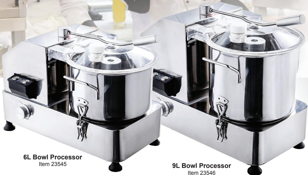
6L Bowl Processor Item 23545