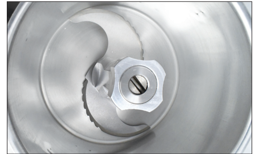
4Cr13 stainless steel knife provides excellent resistance to corrosion and hot oxidation