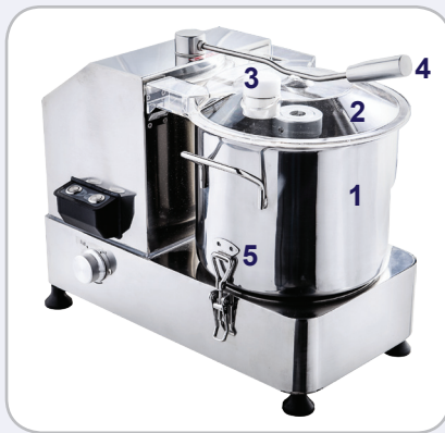
Item 23546 featured