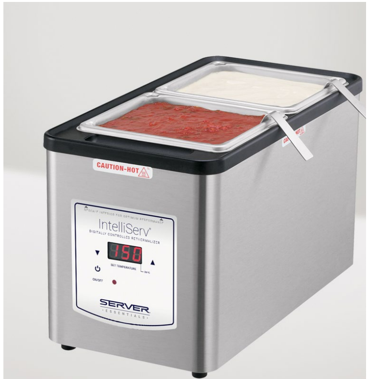
Shown: 1/6-pans and ladles