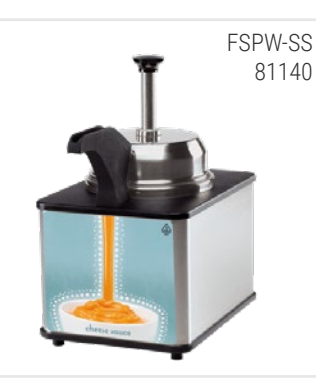
81140 Option: SST Jar 94009 & Storage Lid 94008