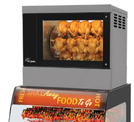
Space Saver with TG 4