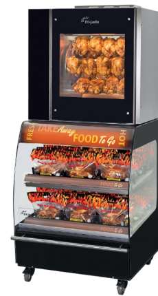
Space Saver with TDR5 P

The Fri-Jado Space Saver is a prime example of effective use of floor space. By combining a TDR 5 or TG4 rotisserie and a Self-Serve grab-and-go merchandiser, you save valuable floor space.