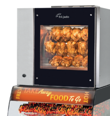
Space Saver with TDR5 P