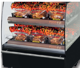
self serve heated merchandiser

* see separate spec sheets for more information on the 4- and 5-spit rotisseries