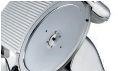
Completely sealed stainless steel shaft