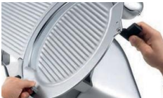
Improved blade guard removal system