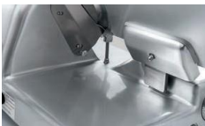
Large receiving tray