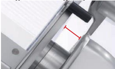
Increased gap between blade and machine body