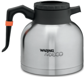
WTC64 64-oz. Stainless Steel Thermal Carafe