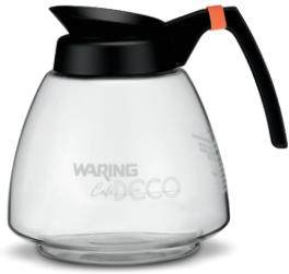
WCDB64 64-oz. Glass Decanter