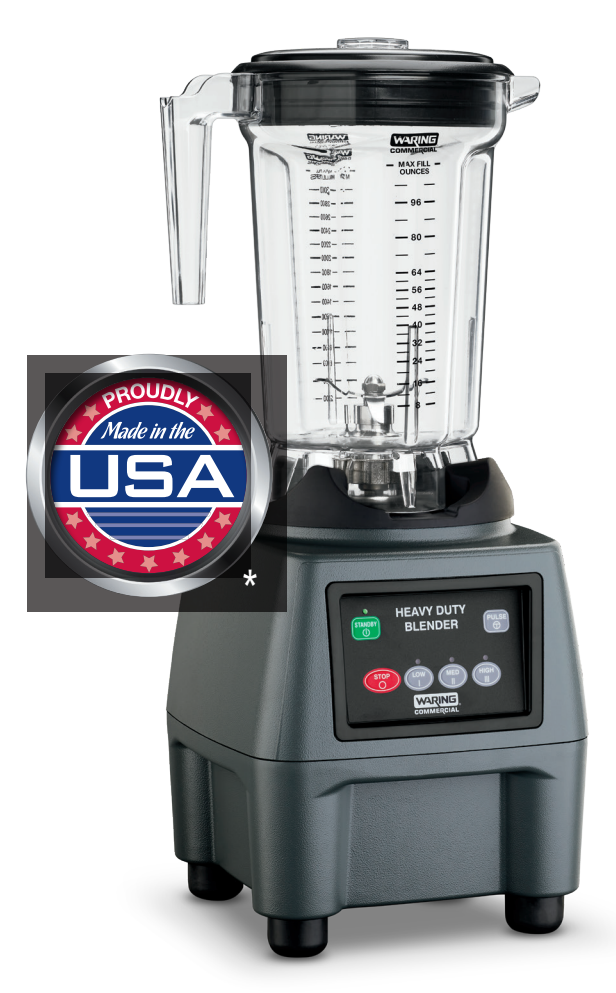
*Made in USA with US and foreign parts.