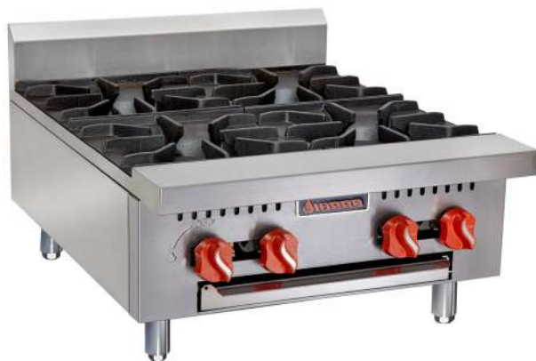
MODEL SRHP-4-24 (Pictured above)