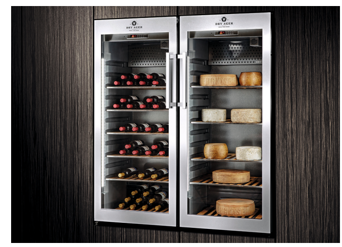
Tempering champagne and wine I production and storing of cheese*

*Shelves in pictures differ from UX 1500 PRO shelves.