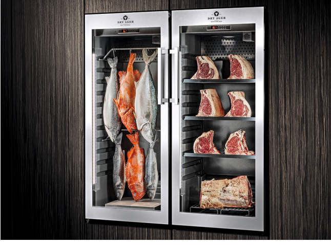
Dry Aging of fish and seafood I Dry Aging of meat*