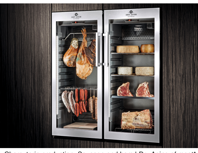
Charcuterie production: Sausage and ham I Dry Aging of meat*