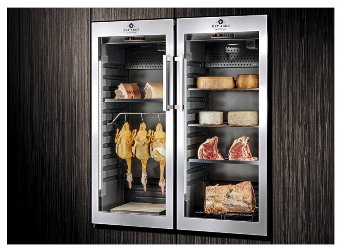
Dry Aging of poultry and meat I storing and production of cheese*