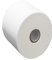
FILTER, PAPER 1 ROLL