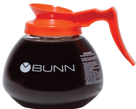
DECANTER, GLASS-ORN 12C 3/CS