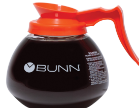
DECANTER, GLASS-ORN 12C 24/CS