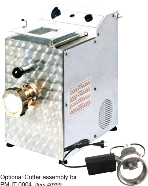
Optional Cutter assembly for PM-IT-0004 Item 40399