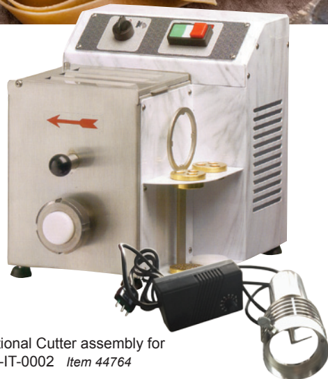
Optional Cutter assembly for PM-IT-0002 Item 44764