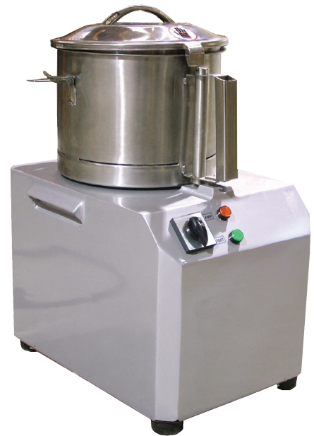
3.2-Quart / 3-Liter