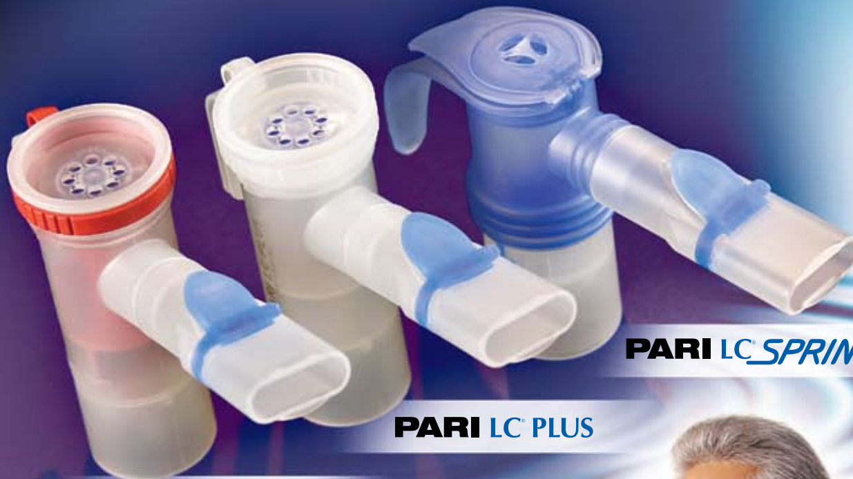
PARI LC STAR