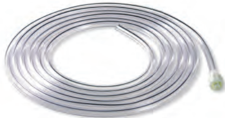
96" pressure monitoring tubing