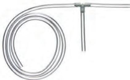
30" dual pressure monitoring extension tubing and T-assembly