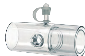
Inline exhalation port connector