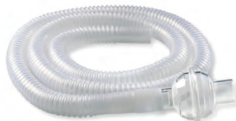
72" disposable bilevel circuit with filter (21952)