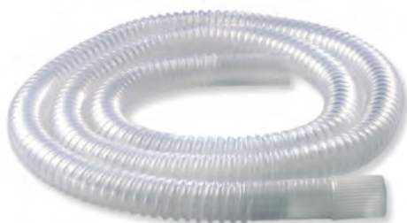
72" disposable bilevel circuit (21953)

Provide your patients with care beyond compare using our universal bilevel circuits designed for single patient use and specifically for use with our high-quality hospital full face and nasal masks. The circuits are available both with (21952) and without a filter (21953) and are described below. Please refer to the user guide for operating instructions.