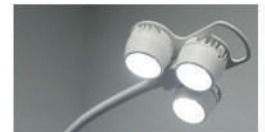
Flex Arm 3x3

YOUR CHOICE: Mobile Stand, Wall Mount or Ceiling Mount