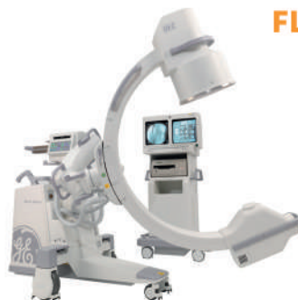
GE OEC 9800