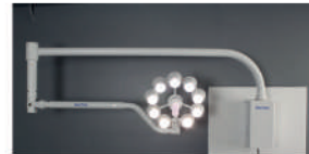
Balance Arm 9x3 Wall Mount