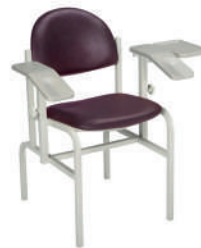
Blood Drawing Chair