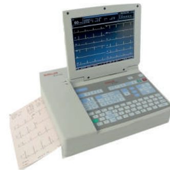
Cardiovit AT-10 Plus

ADD A CARDIOPULMONARY EXERCISE TEST FOR MORE ACCURATE PATIENT HEALTH ANALYZES AND TO MAXIMIZE REIMBURSEMENTS