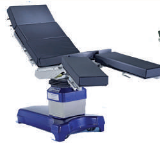
Maquet Alphastar Pro