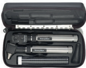
Welch Allyn PocketScope