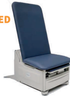
Brewer Flex Access Exam Table