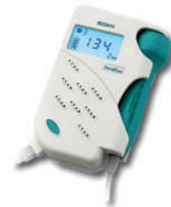
Edan Basic A