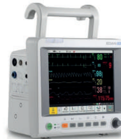
Edan iM60 Patient Monitor