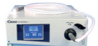
Camera and Light Sources