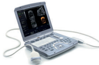
GE Voluson i