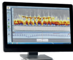
Schiller Medilog DARWIN2 Holter System