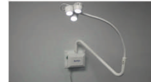
Balance Arm 3x3 Wall Mount.