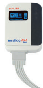
Schiller Medilog AR4 Plus