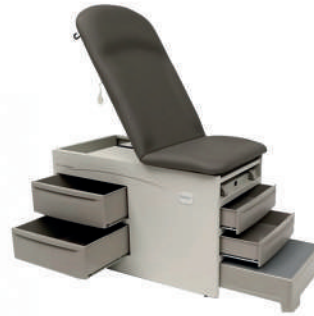
Brewer Access Exam Table