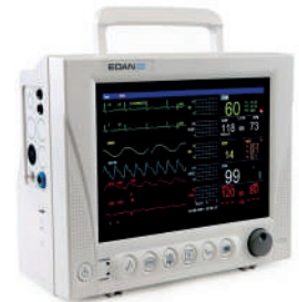
Edan iM8 Patient Monitor