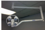
Galaxy Series 4x3 Single Arm Ceiling Mount