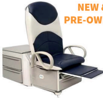
Brewer High Low Exam Table