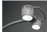
Flex Arm 2x3