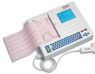
Schiller AT-2 Plus with Spirometry