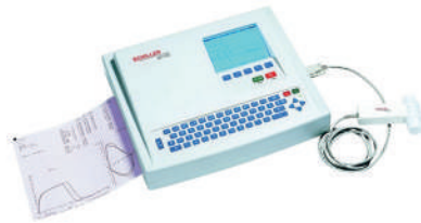
Schiller AT-102 Plus