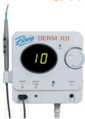
bovie derm 101