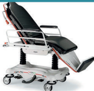
Stryker Chair Stretcher