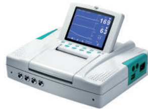
Edan Candence II