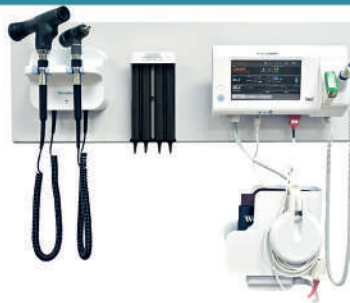
Welch Allyn Green Series 777