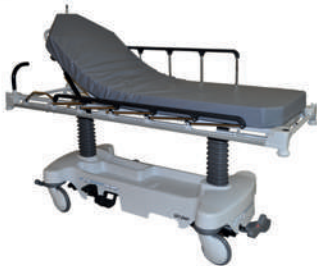
Stryker Transport Stretcher