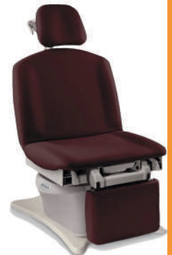
Brewer Flex Access Exam Table