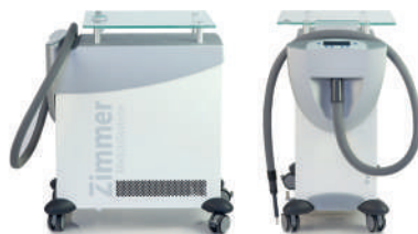
Zimmer Cryo 6