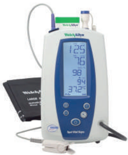
Welch Allyn Spot Vital Signs