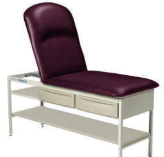
Brewer Basic Flat Exam Table