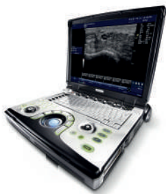
GE Logiq e