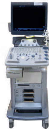
GE Logiq P6