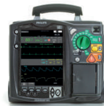
Phillips HeartStart MRX