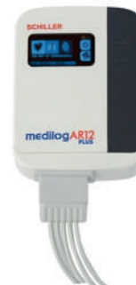
Schiller Medilog AR12 Plus