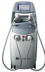
Lumenis Lightsheer Duet