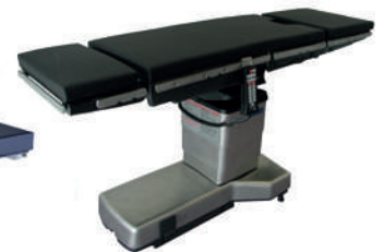
AMSCO Quantum 3080sp

SERVICE TECHNICIANS AVAILABLE FOR REPAIRS AND YEARLY PREVENTATIVE MAINTENANCE!