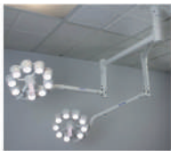
Galaxy Series 9x3 Dual Arm Ceiling Mount