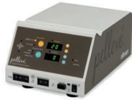
Ellman Pelleve S5