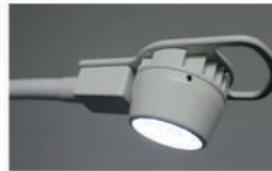
Flex Arm 1x3

YOUR CHOICE: Mobile Stand, Wall Mount or Ceiling Mount