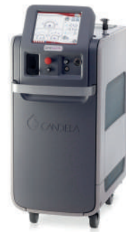
Candela GentleMax Pro

LASERS FOR ALL APPLICATIONS: Skin Resurfacing Photofacials Skin Tightening Hair Treatment Vascular Pigmentation Brown Spots