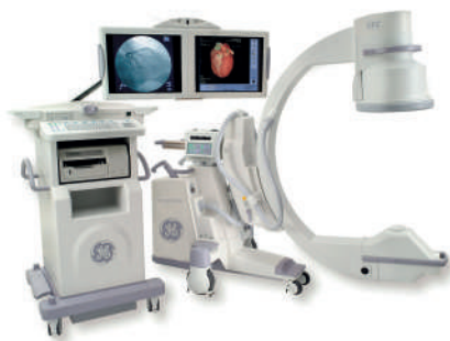
GE OEC 9900