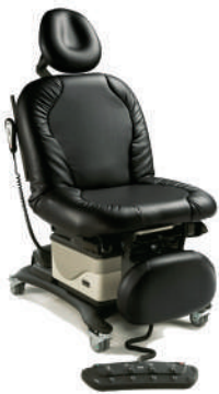
Midmark 630 Procedure Table