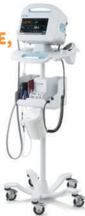
Welch Allyn Connex Vital Signs