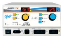
Bovie Aaron 1250