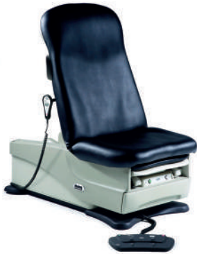
Midmark 625 Barrier Free Power Exam Table