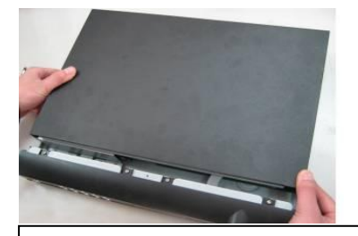
7. Put the cover in accordance with the clip and then place the upper cover back.