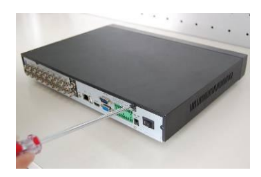
1. Loosen the screws of the upper cover and side panel.

This series DVR has only one SATA HDD. Please use HDD of 7200rpm or higher. You can refer to the User's Manual for recommended HDD brand. Please follow the instructions below to install hard disk.