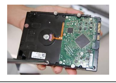
2. Fix four screws in the HDD (Turn just three rounds).