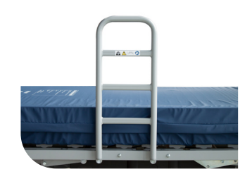
Clamp-on side support rail 5109-2