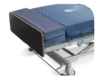
bock® bed extension kit 5066, 5067