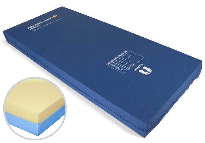
Posture-Temp™ mattress with visco-memory foam layer