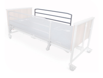
Fold downside rails left/right 910T-L, 910T-R