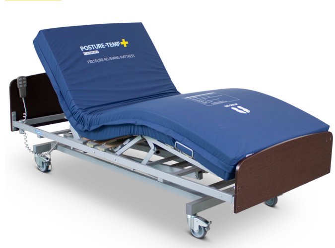
Bock® v2 electric bed with Dark oak endboards

The Posture-Temp™ mattress is made from unique temperature-sensitive, ultra-soft layers of open-cell, slow recovery, visco-memory foam. It warms to conform to the user's shape, maximising the body's contact area and thereby facilitating excellent comfort and support with great pressure redistribution.