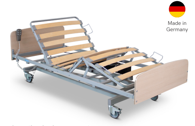
4-section bed movement

Ergo Plus hand controller is designed for ease of use with fully adjustable mounting clip to allow multi positioning. The integrated disabler function allows all electric functions to be disabled with a simple hand controller lock.