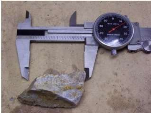
Start: 2" rock