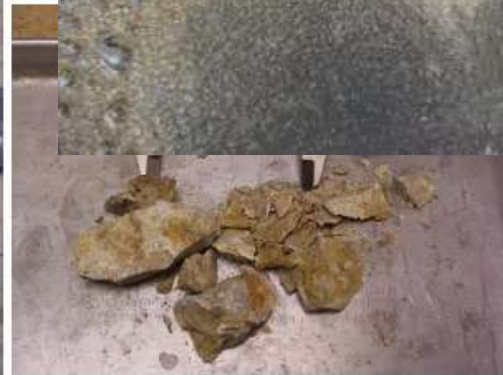
1st Pass: Full Open