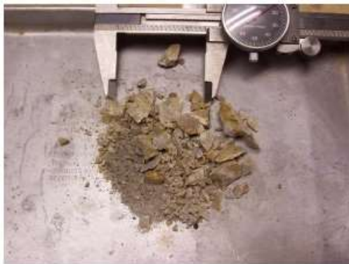
2nd Pass: 1/2 OPEN