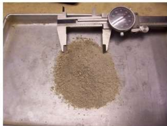
3rd Pass: Closed