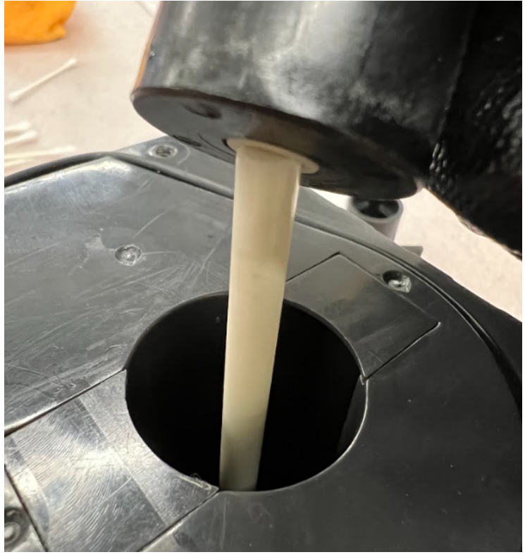
Remove and clean the gasket that seals the face of the pump.