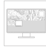
Start stitching the images