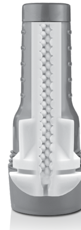
STAMINA TRAINING UNIT™ & ENDURANCE JACK™

Practice makes perfect, especially in the bedroom. Designed to replicate the intense sensations of intercourse, which can help users increase sexual stamina, improve performance and techniques, and intensify orgasms.