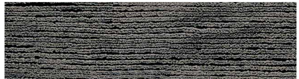
NICKEL NOIR AAC 82/337 (DETAIL)