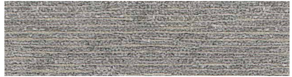
PLATINUM AAC 61T (DETAIL)