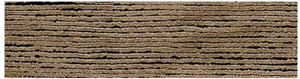
GOLD NOIR AAC 21/249 (DETAIL)