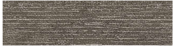
SABLE AAC 21/255 (DETAIL)