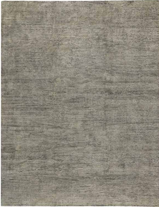
SILVER NOIR AAC 81/311