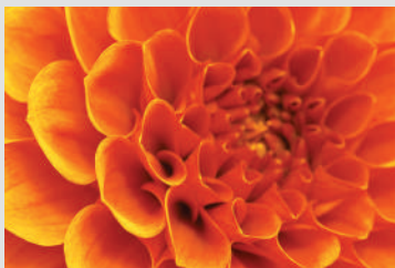
Orange Color Options

Prevents media skewing, resulting in precise winding