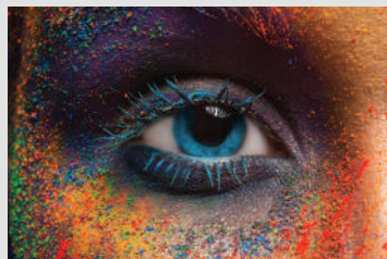
Nozzle Recovery System

Automated monitoring of printhead performance and clogged nozzles