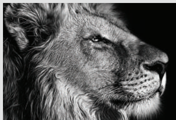
Light Black Color Reproduction

Duplicate the vibrancy of corporate color palettes and fine photography details with ease