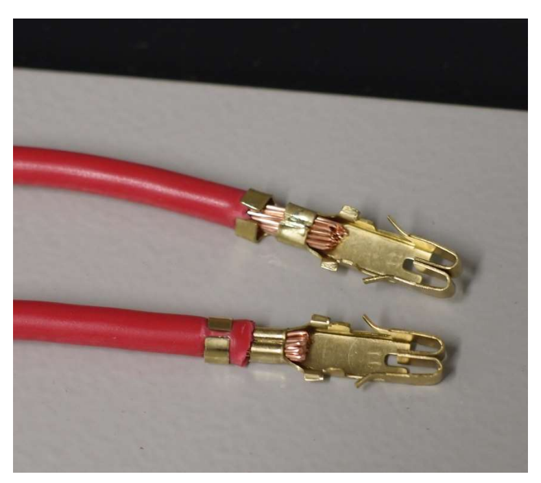
Figure 3: A bad crimp (TOP) has too much insulation stripped, poorly crimped wire holders and the insulation holders are smashing the little bit of insulation they are touching. The crimp on the bottom is 100% reliable.