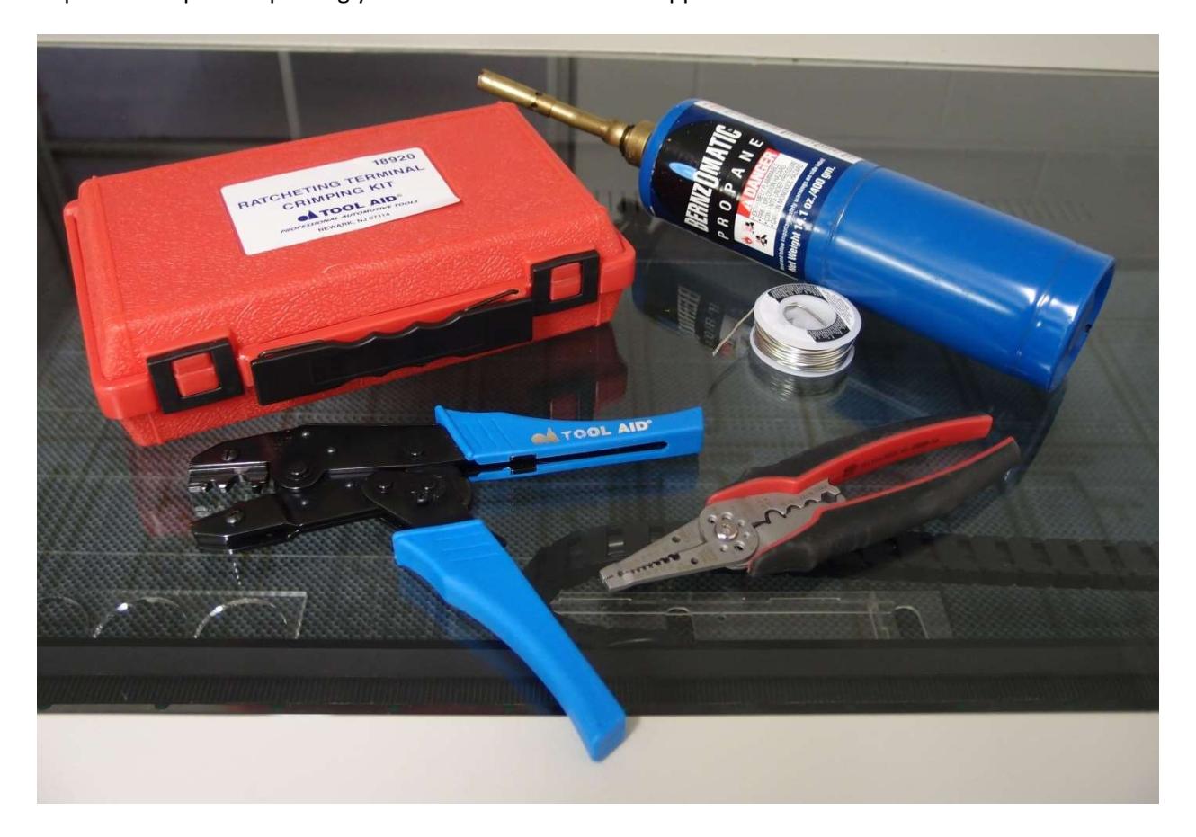
Figure 1: With this small set of good tools you can accomplish a lot!

There are many more advanced aspects of automotive wiring which are important and will (may?) be covered in future articles. Having the right tools and the right parts, however, are the first and most important steps to improving your electrical work both in appearance and function.