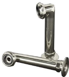
6" Elbow Mounts

BP Polished Brass PN Polished Nickel CP Polished Chrome SN Brushed Nickel ORB Oil Rubbed Bronze