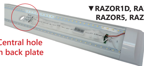
▼ RAZOR1D, RAZOR2D, RAZOR5, RAZOR6