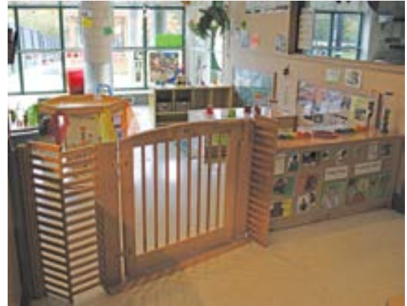
This Roomscapes shelf, connects with the gate to separate an entry/transition area. The clear backing on the shelf secures and protects important visuals. (Centennial College Childcare Centre, Toronto)