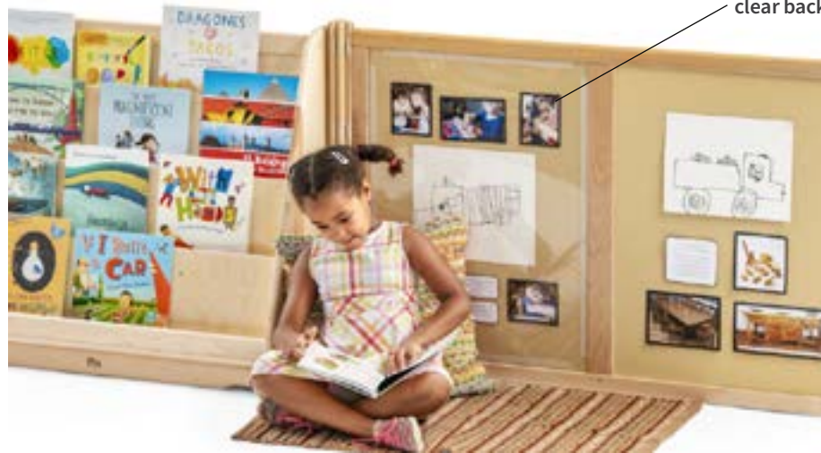
077-F716 in use with clear backing cover