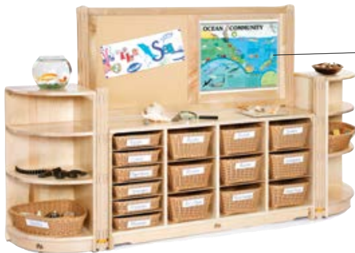
077-F956 Roomscapes Science Set 1 with clear backing cover