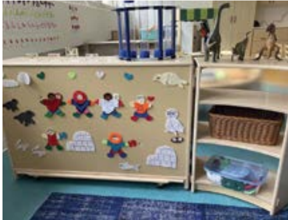
Felt shapes attach without adhesives or pins on the fuzzy back of a shelf. (Pirurviapik Childcare Centre, Ottawa)