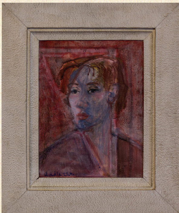
White, Adele (1931 – 1987) Head of a woman, [s.a.] Olieverf op doek / Oil on canvas

Photo: Adele White on the cover of the invitation of a 1964 solo exhibition at the Adler Galleries in Johannesburg.