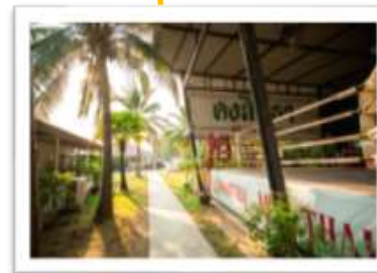
Khongsittha Muay Thai (KST) (Your training gym)