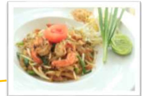
Café Reverie (Your food)