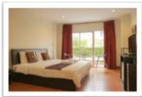
Kiatthada Resort (Your room)