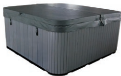
High density lockable cover