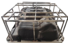
Stainless steel frame with side and seat supports

The shock of cold water can stimulate the release of endorphins, which are natural mood lifters. Some individuals find that cold exposure, including ice baths, contributes to a sense of alertness and well-being. Imagine it as a refreshing mental reset.