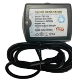
Ozone system – ultimate water management system

It's important to note that while many people find ice baths beneficial, individual responses can vary, and there is ongoing research to better understand the mechanisms and optimal protocols for cold water immersion. Additionally, it's crucial to follow proper guidelines and consult with a healthcare professional, especially for individuals with certain medical conditions prior to using an ice bath.