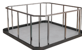
Wraparound base keeps vermin and weather out