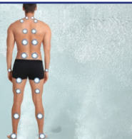
Powerful high flow massage jets