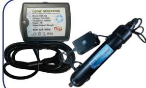
UV Ozone system - ultimate water management system