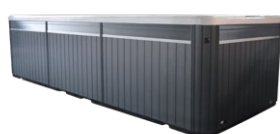
Thermo-wood maintenance free cabinet