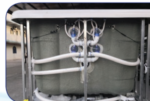
Galvanised Steel frame with side and seat supports