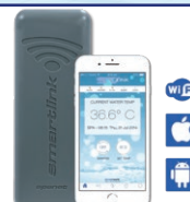
Optional feature - SmartLink to your phone

THE SPA SPECIALISTS WITH THE BEST SERVICE AND THE BEST PRICES .