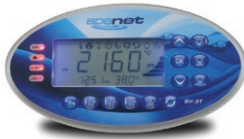
Australian smart SV control system

We're committed to standing behind our products and providing the best service to our customers. With over 40 years experience, using the latest technology, high quality parts manufactured for Australian UV conditions , we will help you find your ultimate spa.