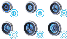
Premium self cleaning, LED "Aqua-ssage" Jets