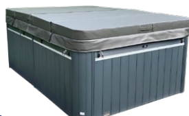
High density lockable cover