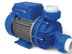
Reliable "Energy Smart" high flow filtration pump