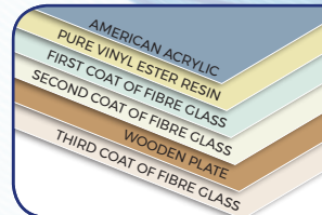
6 layer tough bond shell