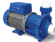
SpaNET - low running cost efficient water flow pump.