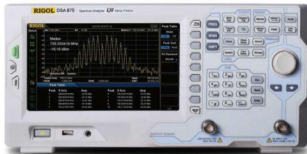
DSA Spectrum Analyzer