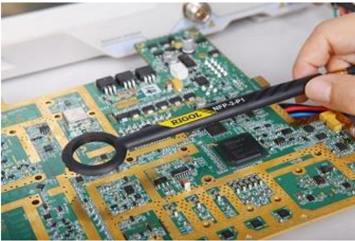
Figure 2: Near field E and H probes used to identify EMI sources