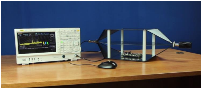
Figure 8: A TEM Cell for repeatable radiated emissions testing

The EMI measurement mode provides the RSA Series spectrum analyzers with limits and CISPR detector modes including Quasi-Peak, CISPR Average, and RMS Average. Engineers also have access to the standard EMI resolution bandwidths (200 Hz, 9 kHz, 120 kHz, and 1 MHz). EMI mode ( Figure 7 ) operates entirely within the instrument from the touch screen or with a mouse and keyboard. This makes it easy to archive reports, run scans, and jump to a signal of interest and immediately debug when needed. The bar graph on the right shows real-time measurements at a given frequency of interest. This utility is made to quickly move to a signal of interest right after a scan without having to change modes. It can show live measurements on up to 3 detectors at the frequency of interest providing an easy transition to debugging and further analysis.