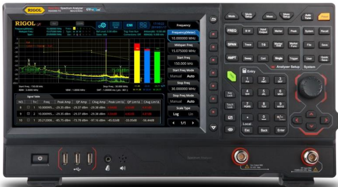
Figure 6: RIGOL RSA5000 Series Real-Time Spectrum Analyzer with EMI

significant power switching frequencies back into the power line. After visualizing these signals care can be taken to filter or improve them if needed before further analysis.