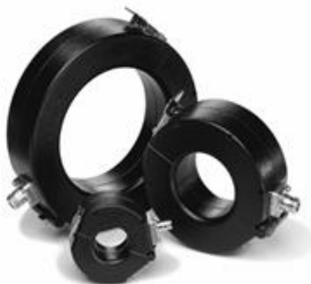
Figure 4: RF Current Probes for Conducted Emissions