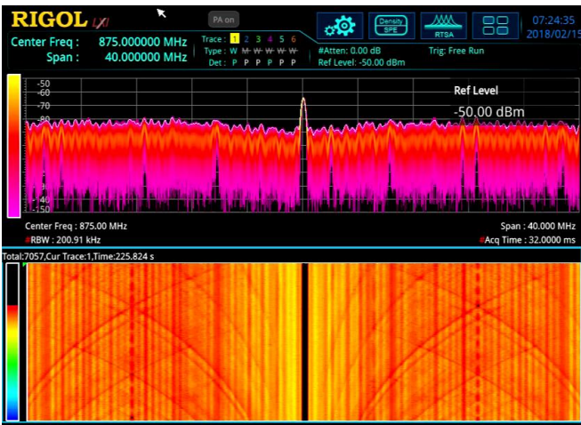
Figure 9: Debugging emissions with the density display (top) and the spectrogram waterfall chart (bottom)