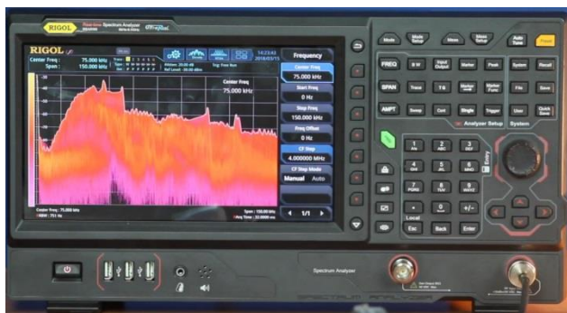
Figure 5: Conducted Emission profile of an LED light fixture

Near field probes pick up emissions that pass through the small loop at the end of the probe. These magnetic probes are relatively inexpensive and make it possible to capture signals only in close proximity to the probe, hence the name 'near field' probe. This makes them well suited to basic visualization because engineers can quickly scan a new board or enclosure looking for problems by passing the probe over the area as demonstrated in Figure 3 . A basic configuration of a near field radiated emissions test would be simply configuring the analyzer to use the peak detector and set the RBW and Span for the area of interest per the regulatory requirements for your device. The Peak detector will provide you with a "worst case" reading on the radiated RF and it is the quickest path to determining the problem areas. Then select the proper H field probe for your design and scan over the surface of the design. Larger probes will give you a faster scanning rate, albeit with less spatial resolution.