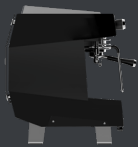
TOTAL MATTE BLACK