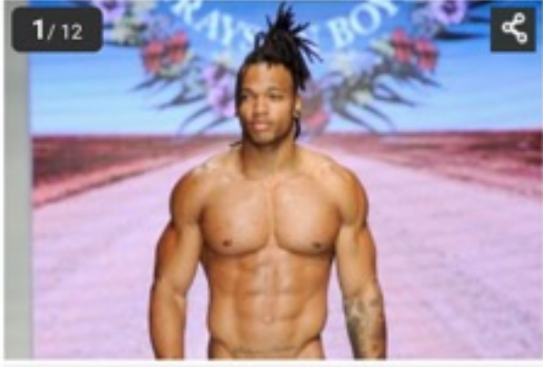
A model walks the runway Grayson Boyd at Miami Swim Week Art Hearts Fashion at FUNKSHION Tent on July 20, 2017 in Miami, Florida.