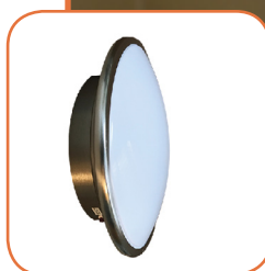
Battery Backup option