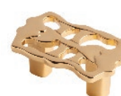
14 = 14k Gold