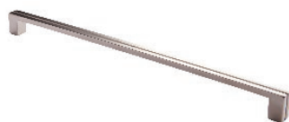
SN = Satin Nickel