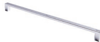
PC = Polished Chrome