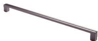
TBZ = Titanium Bronze