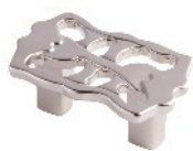
SN = Satin Nickel