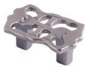
PEW = Pewter