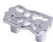
PC = Polished Chrome