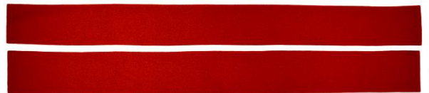
CK629 GTI & CTI DOOR PANEL CARPET

After taking kick after kick the carpets at the bottom of your door panels may need to be replaced, made from our modern cut pile carpet, this is a direct replacement.