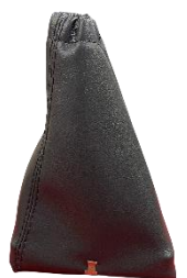
BHH650 GTI & CTI GEAR LEVER GAITER