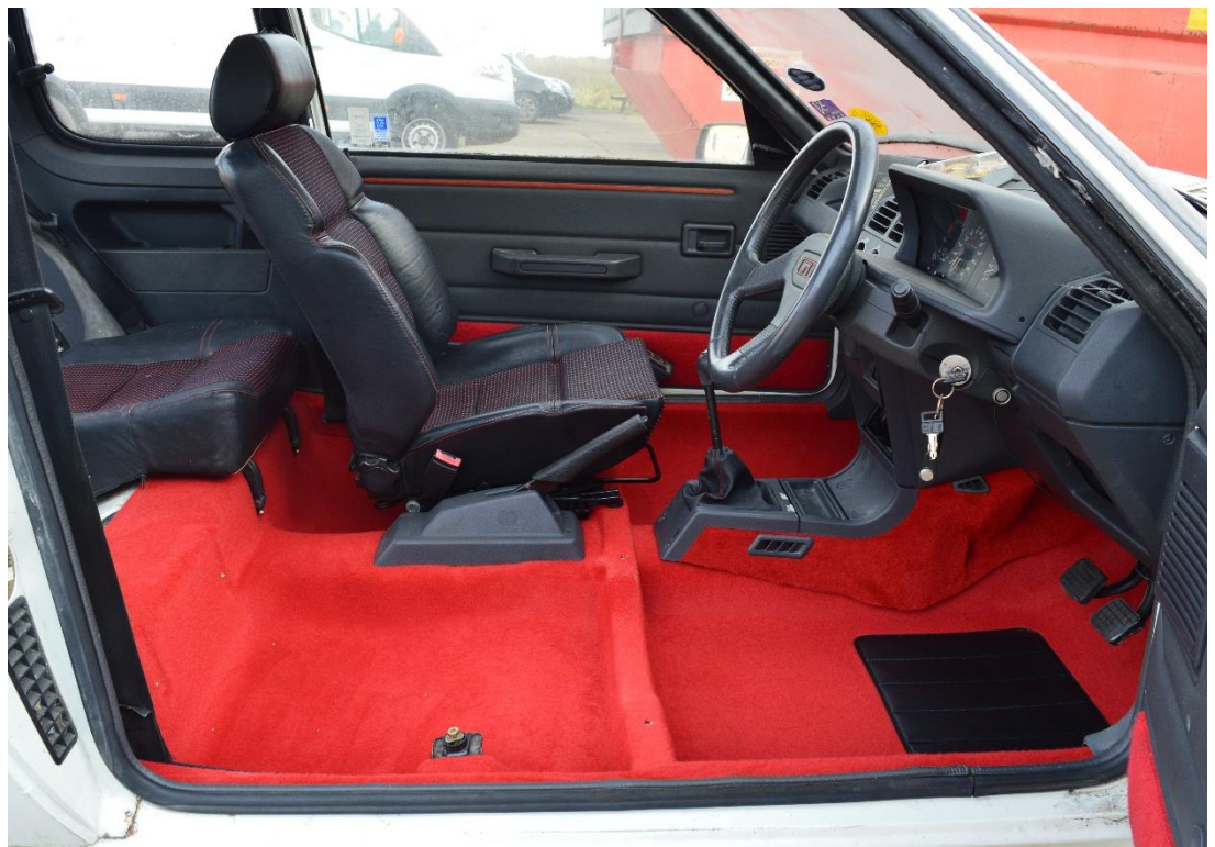
Needle Punch Nylon carpet colours above.