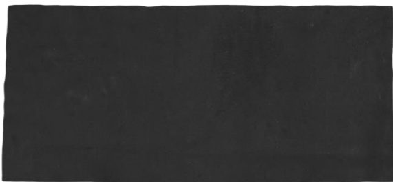
CK626 GTI & CTI PARCEL SHELF RECOVERING CARPET

We have generally found that the rear parcel shelf is in good condition and just needs the carpet replacing, once the original cover is removed this will glue straight on top of the fibreglass.