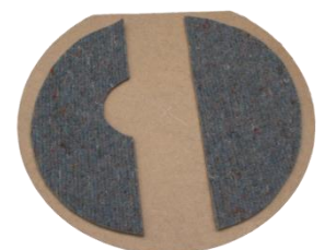
SPARE WHEEL BOARD