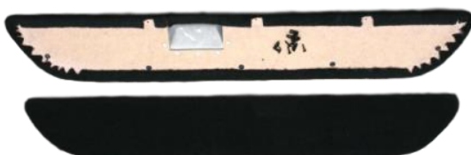
CK5544 TAILGATE TRIM PANEL

Originally this panel was a plastic moulding. Our replacement is a hardboard panel covered in carpet.