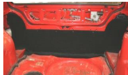
CK5543 CARPETED REAR BOOT TRIM

The area behind the rear lights was not originally covered. We have designed a carpeted piece which can be clipped under the tailgate and will hide the washer bottle and rear light clusters.