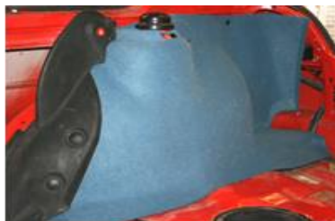
CK5572 FITS ALL HATCHBACKS

These moulded wheel arch covers are an exact replica of your original factory ones. They are ready to fit and if used in conjunction with our rear boot trim, will enhance your boot area considerably.