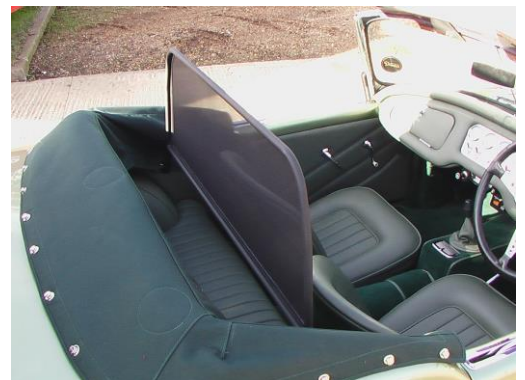
In normal driving position showing hood cover fitted as normal