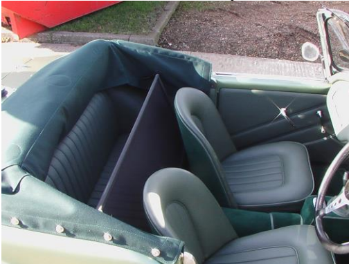
Windstop folded down.