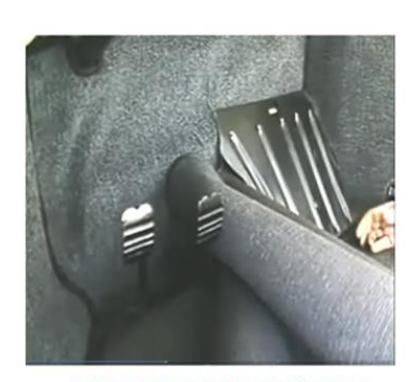
Footrest exposed for reference.

Some cars had a metal plate fitted in the passenger foot well which affects the length of the foot well carpet we need to provide. As the picture indicates this plate angles the foot well, the driver tin plate would have slots cut in for the pedals. As standard these were fitted to models after 1961 for passenger tin or after 1970 for driver tin but these are easily removed or added so best to check before ordering.