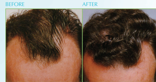
Male: Significant new hair growth in the frontal areas of the scalp.