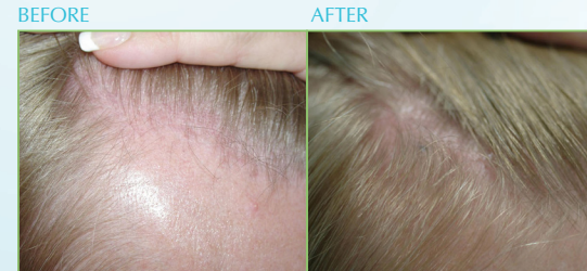
Female: Significant new hair growth in the temple areas.

RESTORE, REVITALIZE AND REGROW YOUR HAIR!