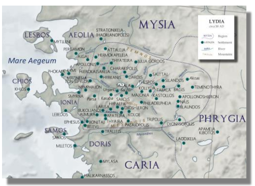
Ionia/Western Asia Minor

IONIA. Phocaea. Ca. 521-478 BC. EL sixth stater or hecte (10mm, 2.63 gm). NGC Choice XF 5/5 -4/5. Female head (Athena?) left of archaic style, wearing banded helmet or tight-fitting cap and floral earring; [to right, seal downward] / Quadripartite incuse square. Bodenstedt 31. Well-centered and sharply struck example, with a lovely mysterious smile. RARE!