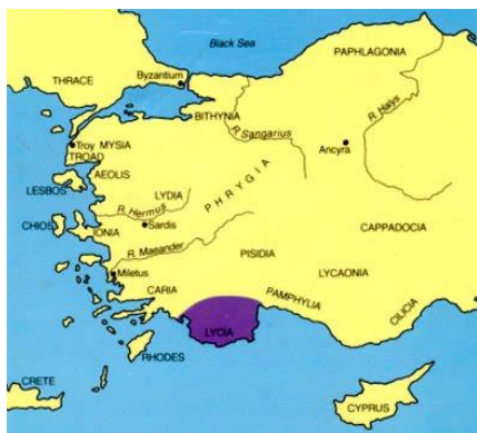
Lycia in southern Asia Minor

LYCIA. Phaselis. Ca. 4th century BC. AR stater (23mm, 10.32 gm, 6h). NGC MS 4/5 - 4/5. Prow of galley right with fighting platform, gunwale decorated with eye / ΦΑΣΗ above galley stern to left. Heipp-Tamer Series 6, Extremely RARE and an unlisted variety. Presents nicely on a relatively broad flan, with satiny silver surfaces.