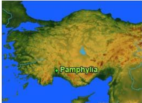
Pamphylia in Asia Minor

PAMPHYLIA. Aspendus. Ca. 380-325 BC. AR stater (24mm, 10.95 gm, 12h). NGC AU 4/5 - 5/5. Two wrestlers grappling, AΦ between / Slinger striding to right, pulling sling taut over head, ΕΣΤΦΕΔΙΙΥΣ upward to left, triskeles in right field. Tekin Series 4. SNG von Aulock 4566. SNG BN 83. Obverse a tad off-center to left, but with a spectacular reverse and beautifully toned overall, with flashy iridescence in fields. Scarce this nice.