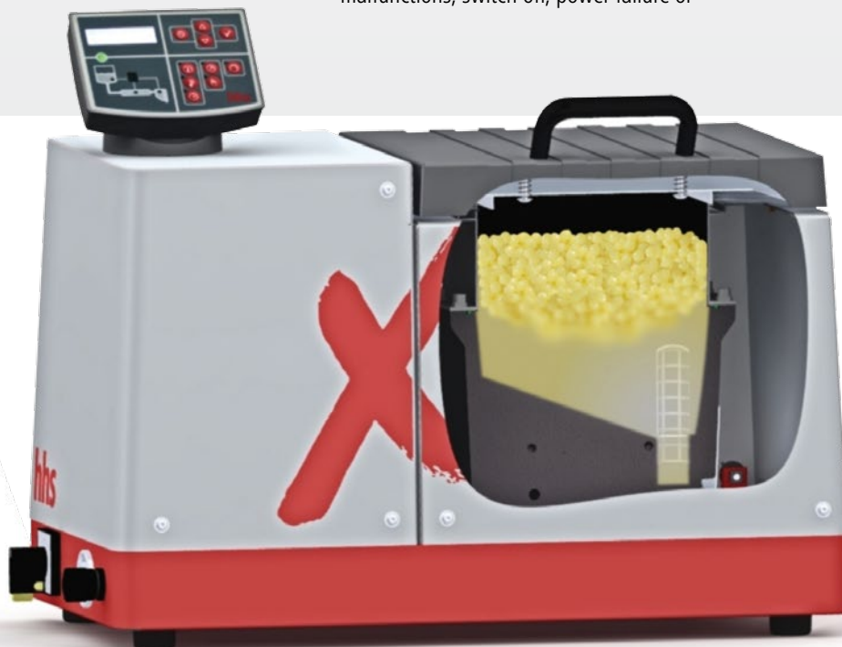
Multi-zone compound tank principle

Thanks to this information the Xmelt® melter can adapt system parameters such as heating algorithms optimally to the connected heads and hoses. Additionally the InterActive technology supports external communication. You as a user can modify data on your computer and even via the internet. On the other end, Baumer hhs can detect problems online and solve them when needed.